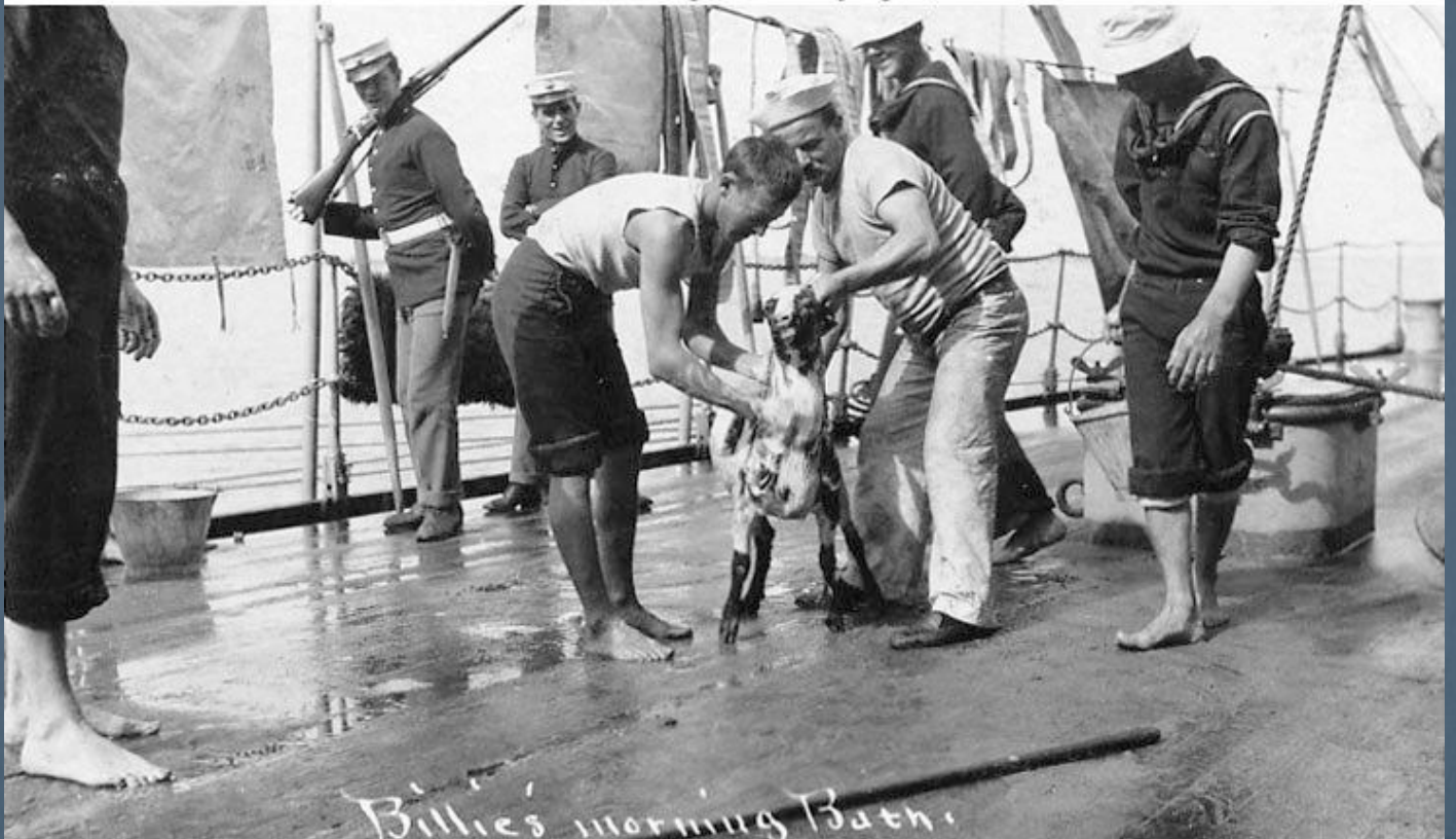
Billie's morning Bath.