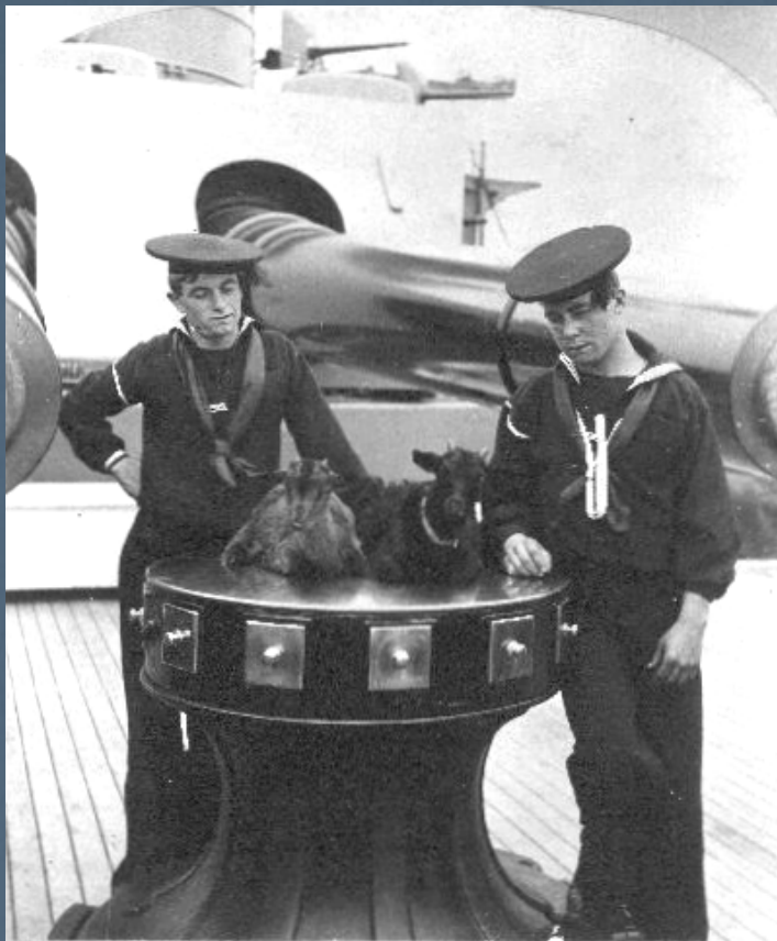
11695—The Mascots of the Battleship Wisconsin.

Crews would feed goats scraps of whatever was available, giving goats another purpose by turning them into the ship's garbage disposal.