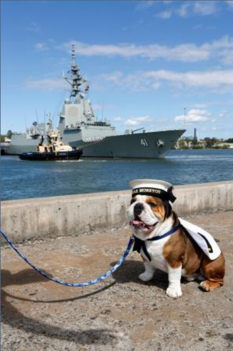
PHOTO: Royal Australian Navy mascot, British Bulldog Leading Seaman Hank, awaits the docking of Guided Missile Destroyer HMAS Brisbane (III) at Hamilton wharf on its first visit to Brisbane.

A little-known piece of Navy history dating back to the First World War, is being kept alive with a British Bulldog by the name of Hank, becoming the first mascot for 'the Steel Cat', HMAS Brisbane (III).